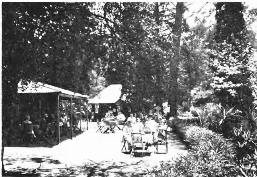
The original Botanical Gardens tea room, which one might patronise on a Sunday morning for light music, or visit at azalea time for a spectacle 'more vivid and flamboyant' than 'in its far eastern habitat'.

But motor-cars didn't put an end to some favourite outings by public transport. For instance there was the popular Sunday tram ride to the Botanic Gardens. At the wood-and-iron Gardens Tearoom the curator would put out several rows of wooden chairs and set up his huge HMV Gramophone, with only its shell-shaped horn for amplification, to pass the morning with records of light classical music. The seats were invariably all taken. Nor did Maritzburgers give up the splendid train-rides to Sweetwaters or to Howick. I would guess, listening to accounts of these expeditions, that thermos flasks got here comparatively recently — no picnicker set off without a kettle and a small bundle of wood to make a fire.